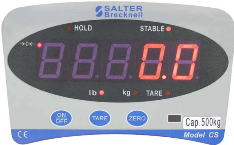
Figure 1.1 Model CS front panel

Figure 1.1 shows the front panel of the scale.